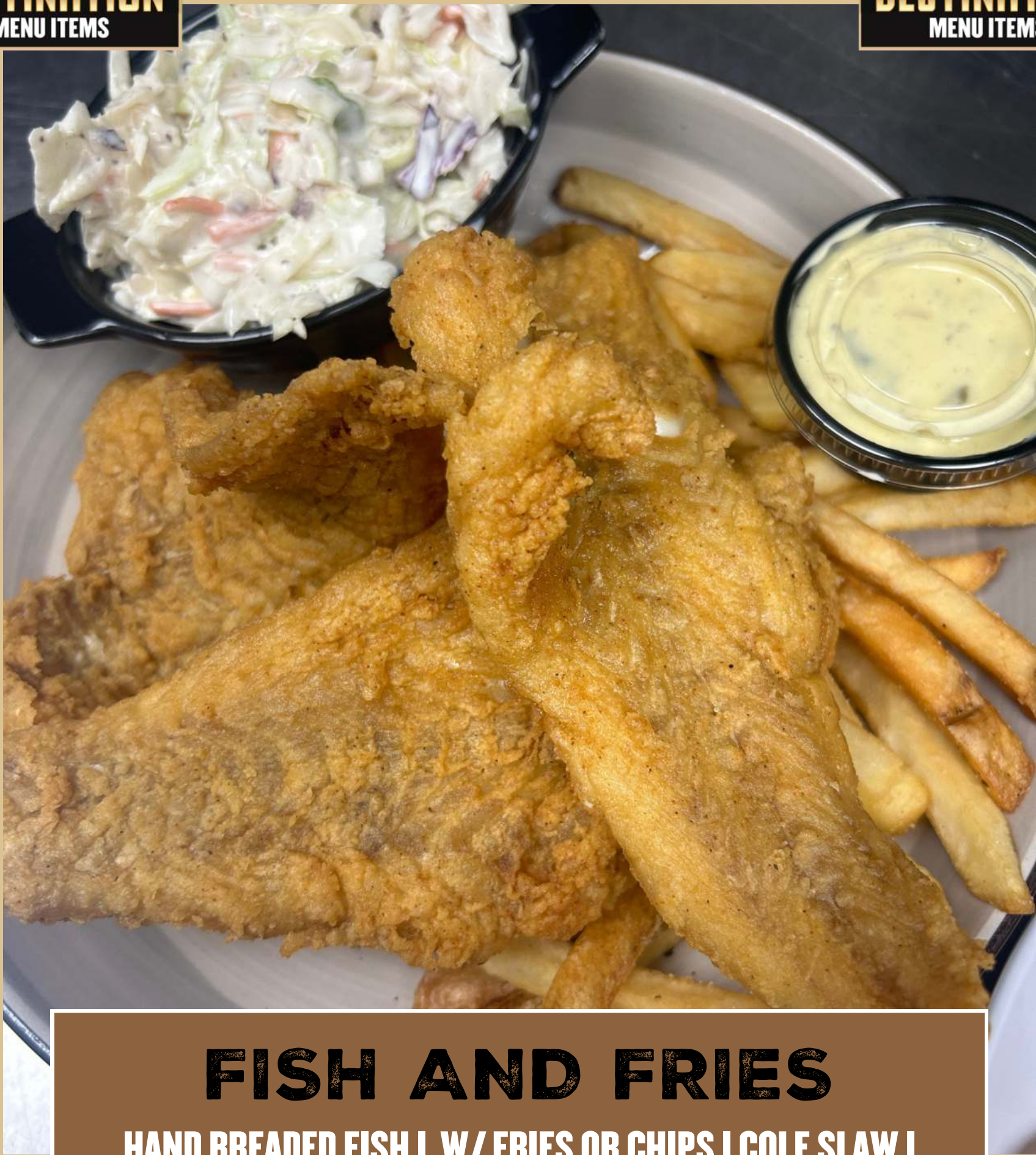
FISH AND FRIES HAND BREADED FISH | W/ FRIES OR CHIPS | COLE SLAW | SIDE OF TARTAR