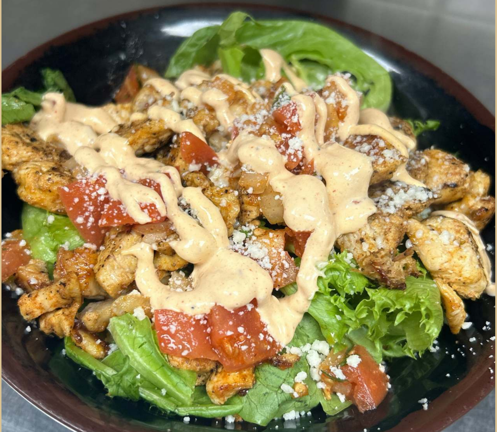
CHICKEN MOJITO BOWL MEXI-RICE | GRILLED SEASONED CHICKEN | FRESH GREENS | FRESH PICO | QUESO FRESCA | CHIPOTLE RANCH